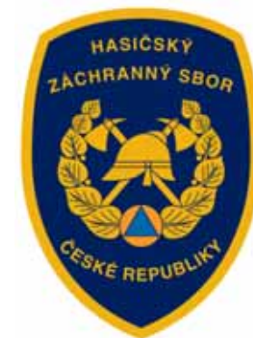
Fire Rescue Service of the Czech Republic